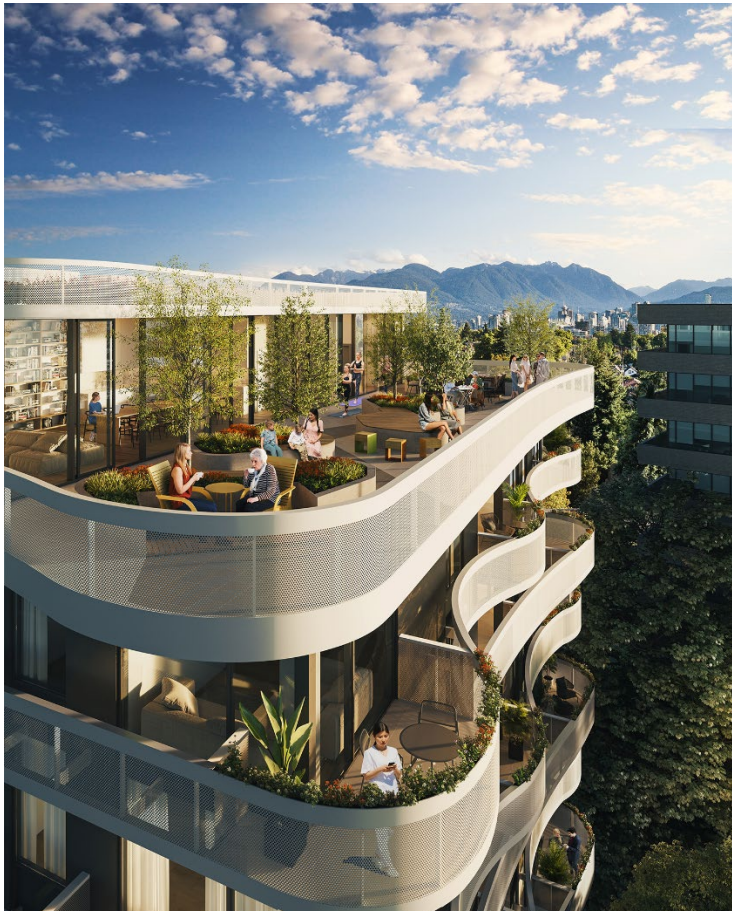
Artistic rendering of SAH's rooftop garden, one of the outdoor spaces to help women connect and thrive.